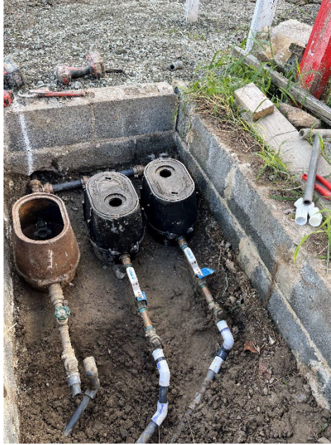
Figure 1: Water components being replaced in the Strawberry Hill neighborhood yesterday, November 1, 2023, St. Croix, USVI.