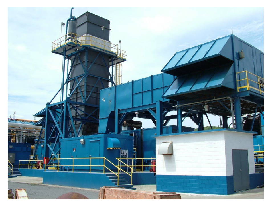
Figure 1: Virgin Islands Water and Authority's Estate Richmond Power Plant on St. Croix, US Virgin Islands.