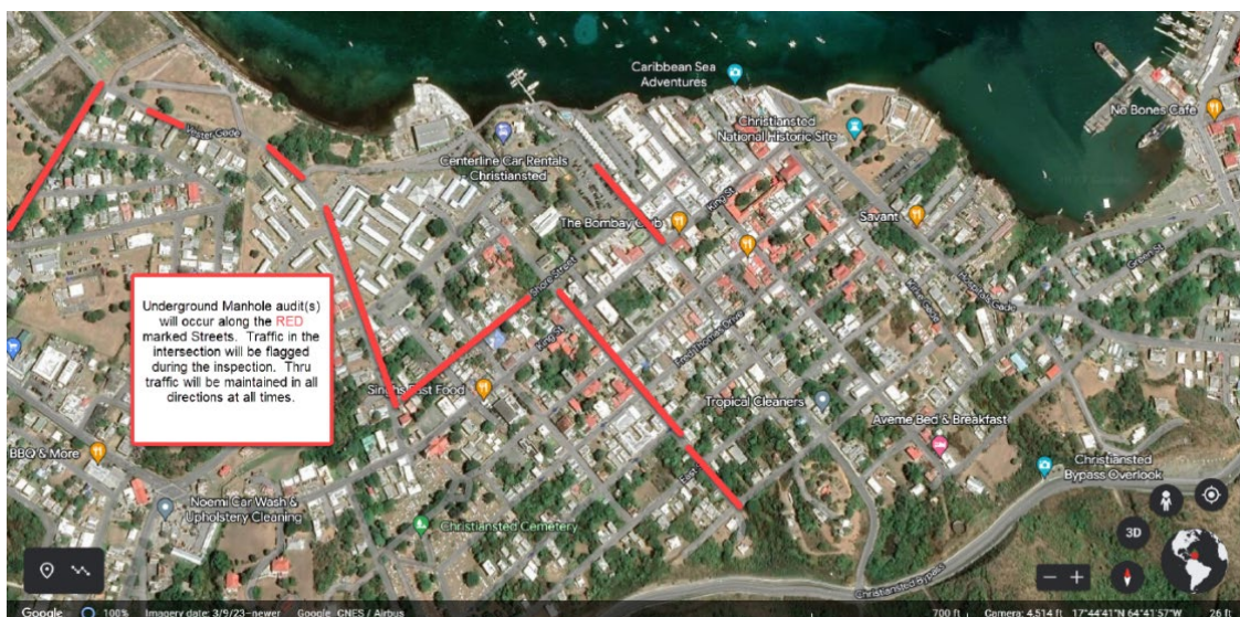
Figure 2: Red highlighted streets indicate where underground manhole audits will be occurring.