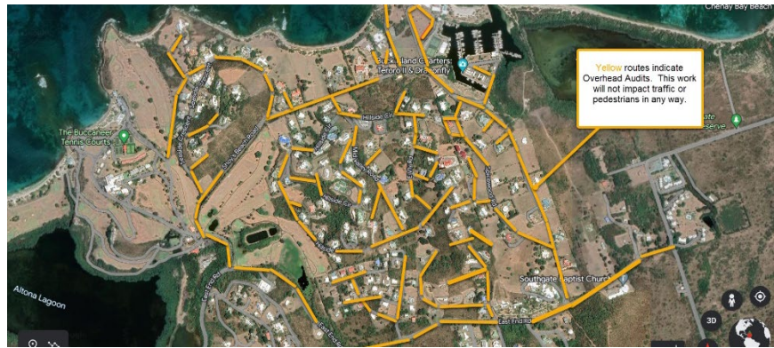
Overhead Route 11: Audits will be performed on the main route on East End Road starting from the Buccaneer Hotel entrance and ending at the Southgate Great Pond Road intersection. The audit will also include the neighboring Buccaneer area consisting of the Shoy and Annas Hope community.