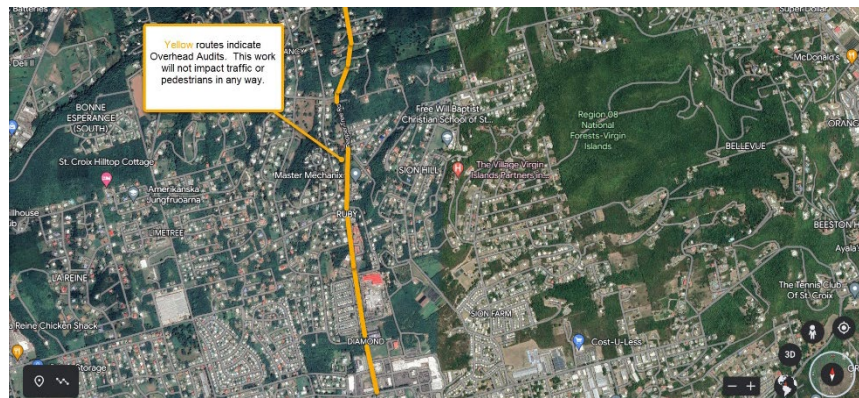
Overhead Route 12: Audits will be performed on the main route on Claude A. Benjamin Memorial Drive starting in Rattan and continuing towards Sunny Isles, ending at the Queen Mary Highway intersection in front of the WAPA Business office in Sunny Isles.