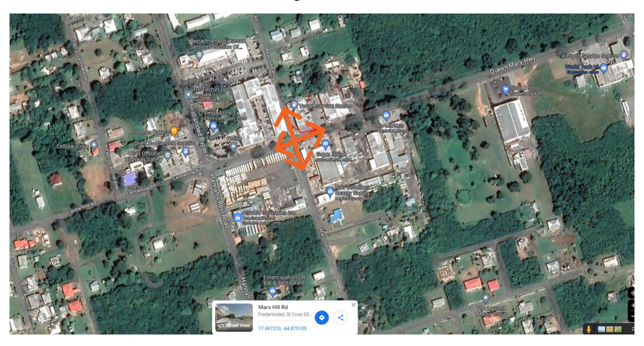
Figure 1: Orange arrows indicate where road construction will be taking place.