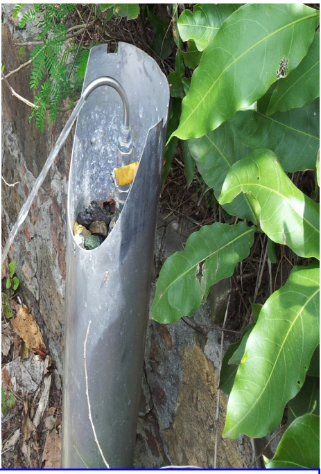
Photo above depicts one of VIWAPA's STT/STJ water sampling stations.